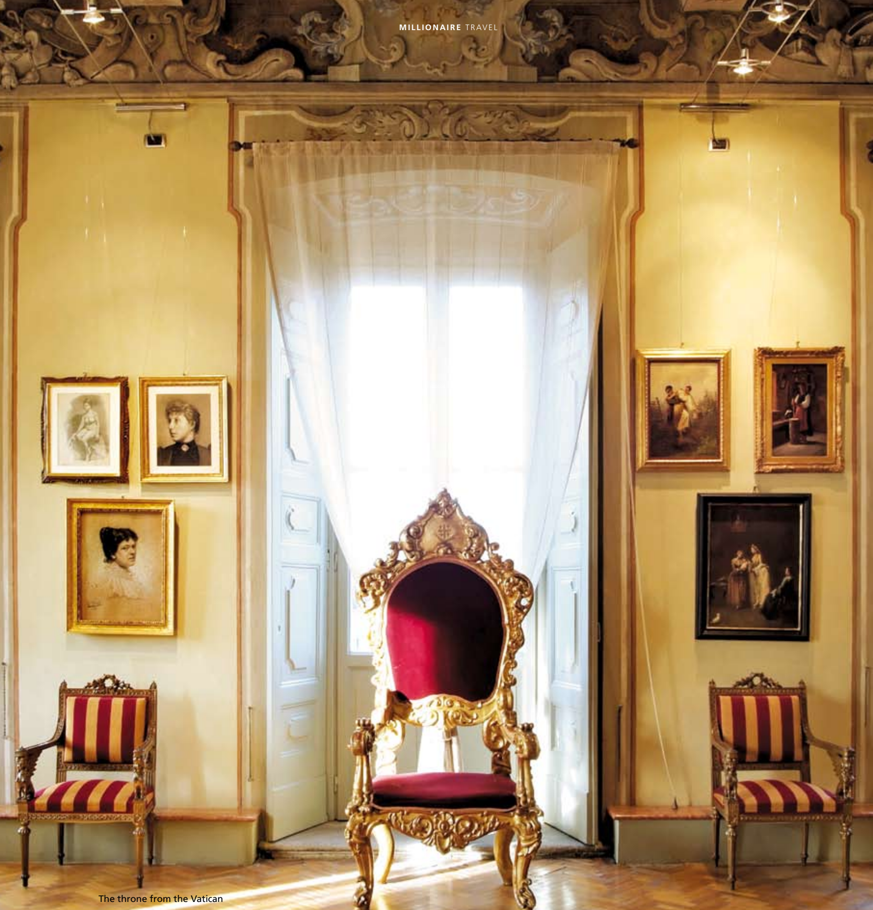
The throne from the Vatican

YOU COULD WANDER INTO THE PERMANENT ART MUSEUM THAT HOSTS WORKS BY RENOIR, MONET AND CHAGALL ALONGSIDE MANY RUSSIAN ARTISTS