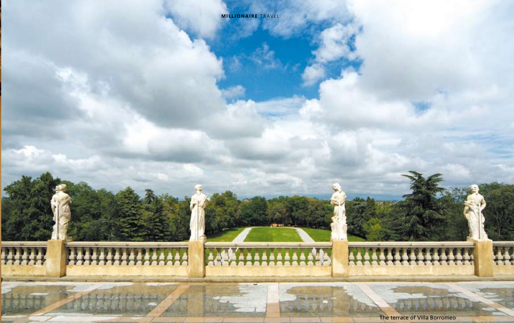
The terrace of Villa Borromeo

are held. It is not a campus area with students,” Frua de Angeli says.