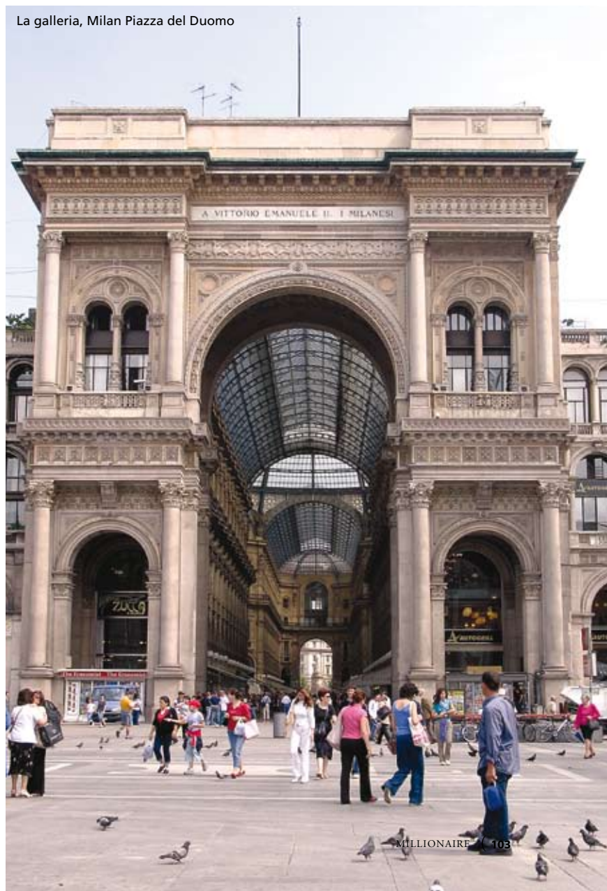
La galleria, Milan Piazza del Duomo

"Basically, the University of the Second Renaissance is a cultural foundation where lectures, conferences and meetings